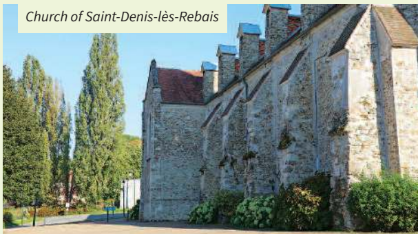
Church of Saint-Denis-lès-Rebais

The priest also made a feature of the miraculous spring. Every year, on the first Sunday in September, a mass is celebrated in honour of Saint Aile. His relics have been conserved at the church Saint-Jean-Baptiste de Rebais which also features the “Gisant de Saint-Aile”, a 13 th -century sculpture depicting the saint with his cross and a book.