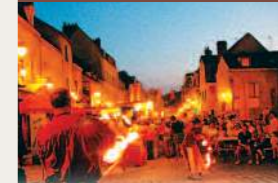
Feast of Saint-Ayoul