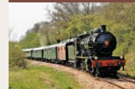
The Longueville AJECTA Railway Museum