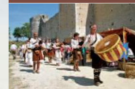
Medieval Festival of Provins