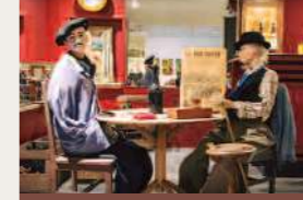
The "Musée de la Vie d'Autrefois" in Les-Ormes-sur-Voulzie