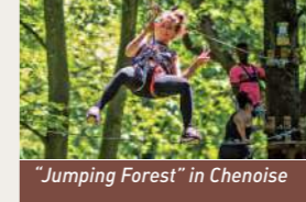
"Jumping Forest" in Chenoise

This is not the complete list of events and places that should not to be missed. A calendar is available on www.provins.net or call Provins Tourisme.