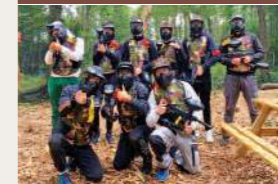
Paintball in Poigny